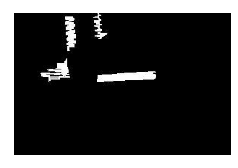
Figure 6. Binary image with unwanted region eliminated.

2. Remove small objects on the base of area idx = find([STATS.Area] > 500); bw2 = ismember(L, idx);