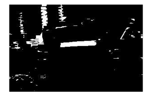
Figure 5. Binarized image

Fig.5 shows binary image. For a given gray scale image, examine the intensity value of each pixel. If it is above a threshold, we mark it as white; otherwise we mark it as black. The threshold chosen for the candidate selection process is 102 (given intensity values ranging from 0 to 255). This threshold is chosen based on examining. Having only black and white pixels makes the image much easier to work.