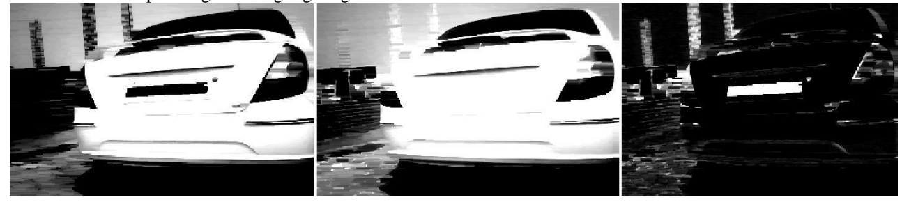
(a) (b) (c) Figure 4 (a) Opening (b) Closing of gray scale image & (c) Difference of opening and closing image

Opening is nothing but erosion followed by dilation and closing is inverse of opening. Opening of image is processes of adding pixel to boundary & closing is removing of pixel from boundary. Firstly, enhanced image is opened and then closed using imopen and imclose function respectively. Fig. 4.Shows (a) opening image & (b) closing image. Once we get this two image take different of them. We get difference result as show in fig.4 (c). In which we can see that license plate region as highlighting.