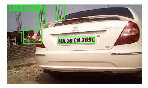
Figure 7. Mapped candidate region

Bounding box is dimension of rectangle box created around the connected object within an image. Fig. 7 shows a bounding box mapped image.