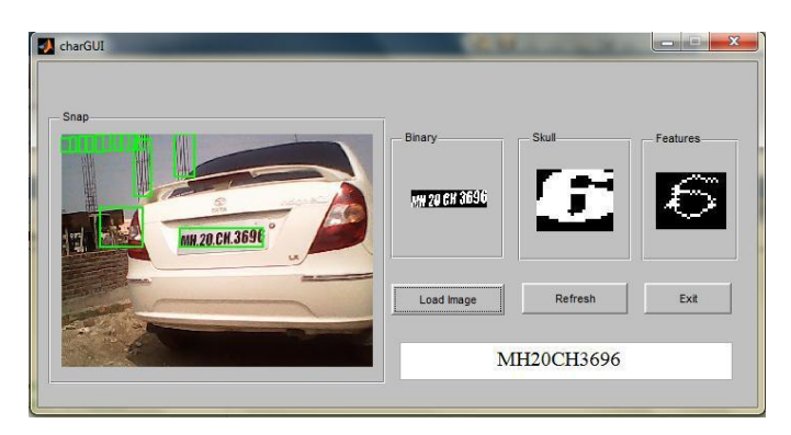
Figure 12. GUI model for license plate recognition system

Axes 1 (Input) shows the original image and candidate region mapping on original image. Axes 2 shows the mapping of character to be segmented. Axes3 shows the segmented character image and axes 4 show the skeleton of each segmented character. Two push button are provided namely refresh and exit. A graphical user interface provides the user with a familiar environment in which to work.