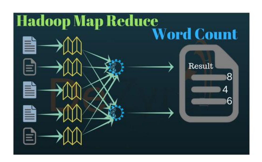
Fig 2:Map Reduce Technique to output the word count.