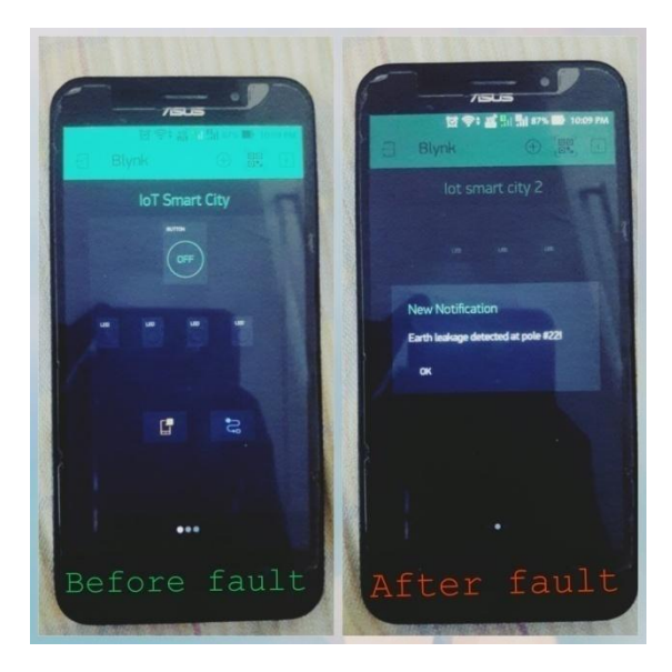
Fig. 3 Control and monitoring in an authenticated device.

Now considering the case of 'Water leakage detection', Here wire mesh is employed around the underground water pipe and the circuit is open. When the water leakage occurs, it closes the circuit. Hence the comparator senses the signal and sends it to the chip. The chip takes further actions as described earlier. The same principle holds good in the case of 'Drainage overfill' case.