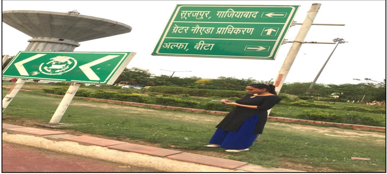
Fig 2 Data collection at Authority rotary intersection

This study is concerned with determine the PCU values of vehicles in under mixed nature traffic flow at on congested Authority Rotary. It is channelized intersection at-grade circular rotary system is available. Traffic volume is medium. Traffic volume increases because population of Greater Noida increases. Rotary intersections or round about are special form of at-grade intersections.