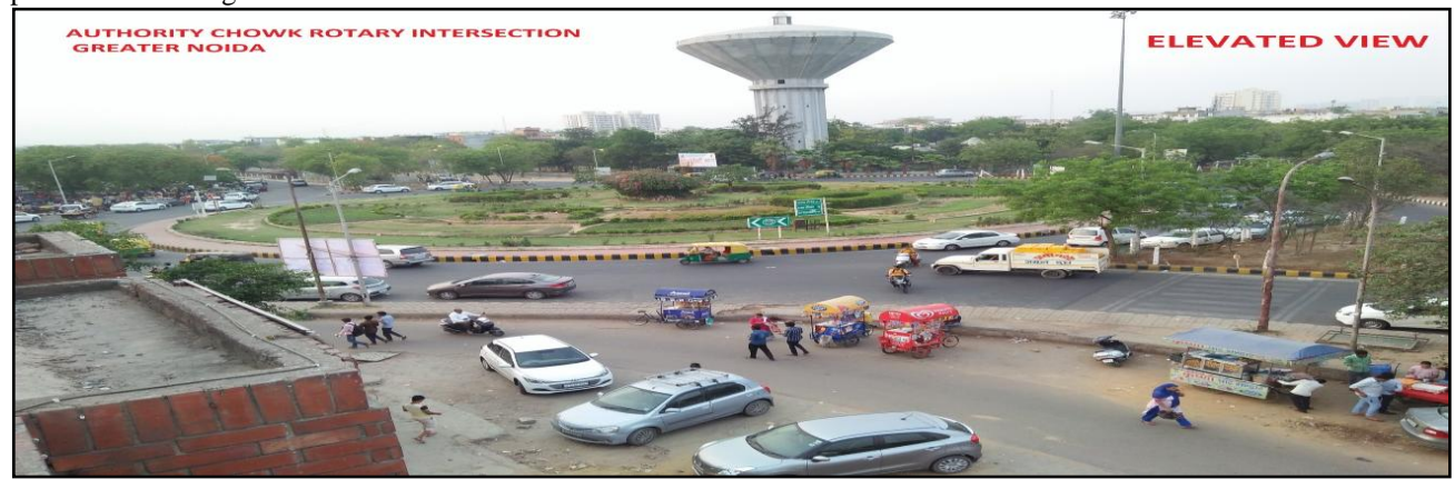
Fig 1 Elevated view of rotary intersection at authority

The Increase within the traffic is turning into sever downside. And this downside is inbound as a result of owning of private automobiles. To effectively dominant of this increasing traffic on road some control measures square measure used on road i.e. traffic rotary, traffic light, direction of road etc. An intersection is the area where two or more streets join or cross at-grade. Channelized intersections use pavement markings or raised islands to designate the meant vehicle methods the foremost frequent use is for right turns, notably once in the course of associate auxiliary right-turn lane. The roundabout may be a channelized intersection with unidirectional traffic flow current around a central island. All traffic through further as turning enters this unidirectional flow though sometimes circular form, the central island of a roundabout may be oval or on an irregular basis formed. Traffic flow is regulated to in one direction of movement, thus eliminating severe conflicts point between crossing movement. Rotaries do not need practically any control by police or traffic signals.