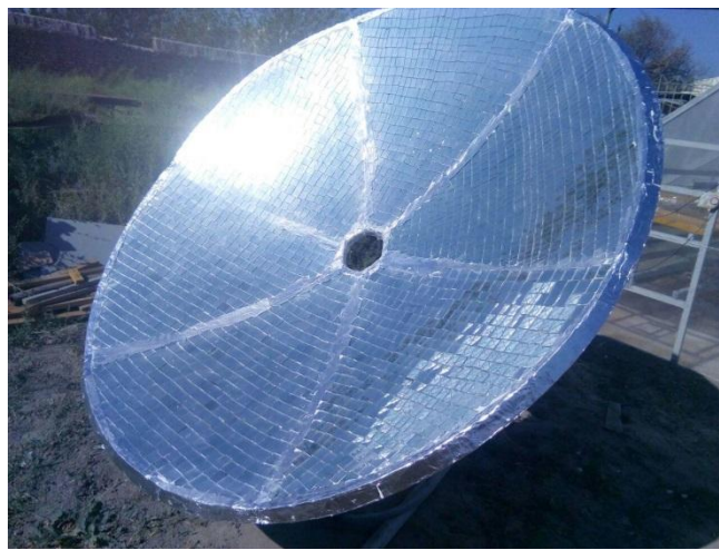
Fig. 1 Appearance of the fabricated parabolic concentrator

To obtain reliable data and compare them with each other, two options for the experimental setup were selected. A standard offset satellite dish with a diameter of 1.8 m was taken as the base of the parabolic solar concentrator of the first embodiment. The antenna surface was covered with a cotton cloth and pre-prepared 3x4 cm mirror pieces were glued onto it. The total surface area is 2.54 m 2 .