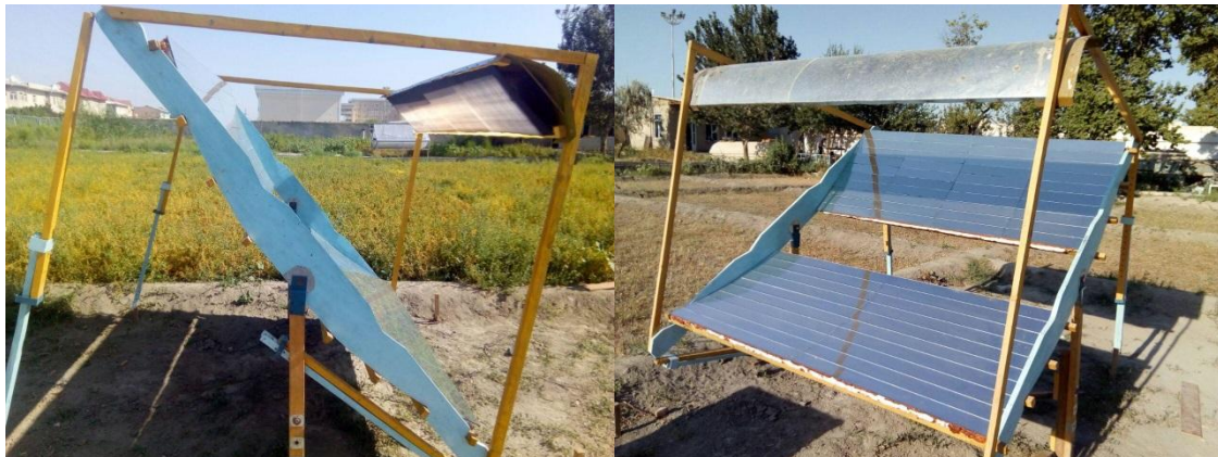
Fig. 2 Appearance of parabolic cylindrical hub

To do this, originally wooden planks measuring 2.4 m in length and 2 m in width were parabolic in shape. They served as the foundation for mounting on them two reflective surfaces 2 m long and 80 cm wide. Between them 30 cm of space were left, because there is a focus on top and reflective radiation should not fall from it. On the stand of the concentrator, whose height is 1 m, levers are attached, the purpose of which is to manually adjust the position of the device depending on the location of the Sun. These levers can change the height of the hub supports that support it from all sides. The total surface area is 3.2 m 2 .