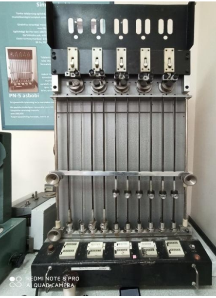
Figure 1. The appearance of the PN-5 pulsator device